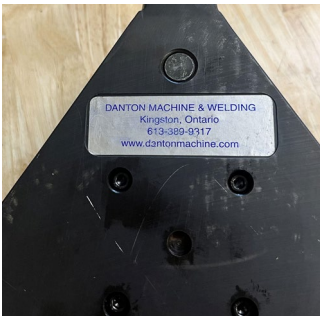
Official Danton Name Plate