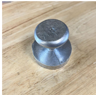
Disc-Mould coupon ~57mm