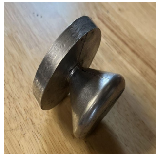
Disc-Mould coupon ~10mm