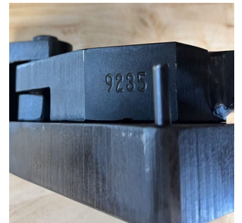
Traceable serial number

Contact Danton today for a quote on the industry standard Type B Spectrographic Disc Mould.